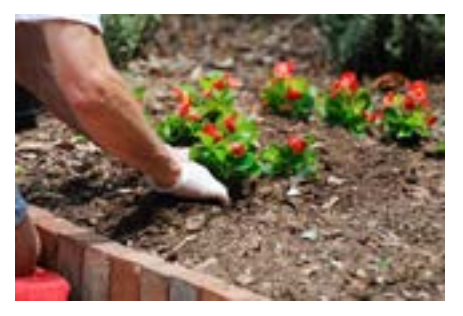
Compost is used to fertilize plants, gardens, and other outdoor areas.

The material is placed in large piles, where microorganisms begin to break it down and heat up the piles to very high temperatures.