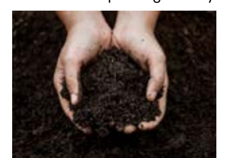
After about 12 months, the material breaks down and is transformed into an earthy, soil-like material called compost.